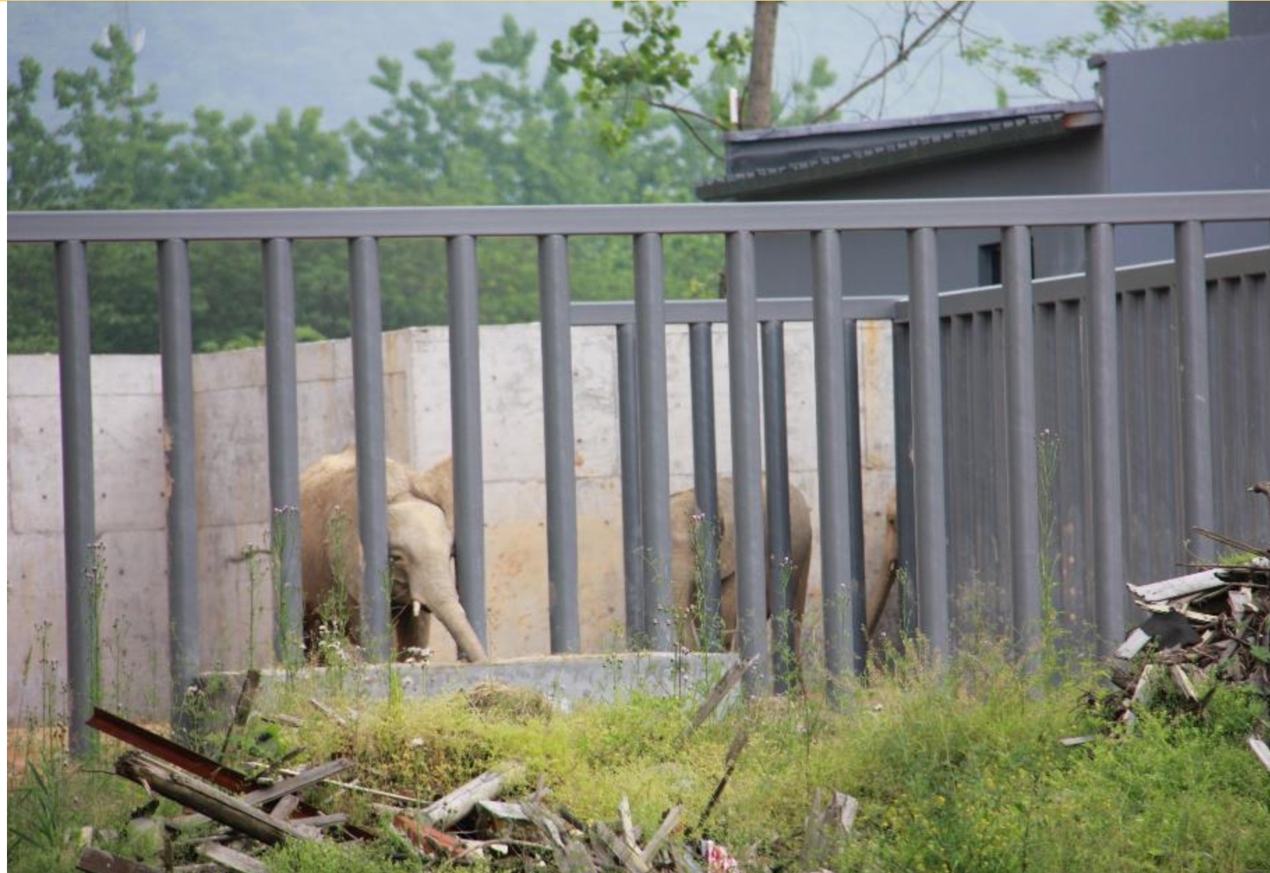
Photo taken in May 2017, park staff confirmed all six were still at the facility

Imported 6 African elephants in December 2016